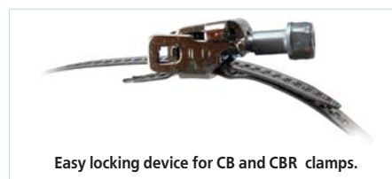
Easy locking device for CB and CBR clamps.