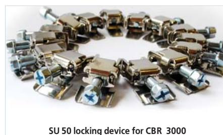
SU 50 locking device for CBR 3000